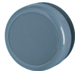
FB Bell Grey